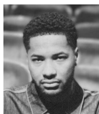
SEIKO VICE PRESIDENT