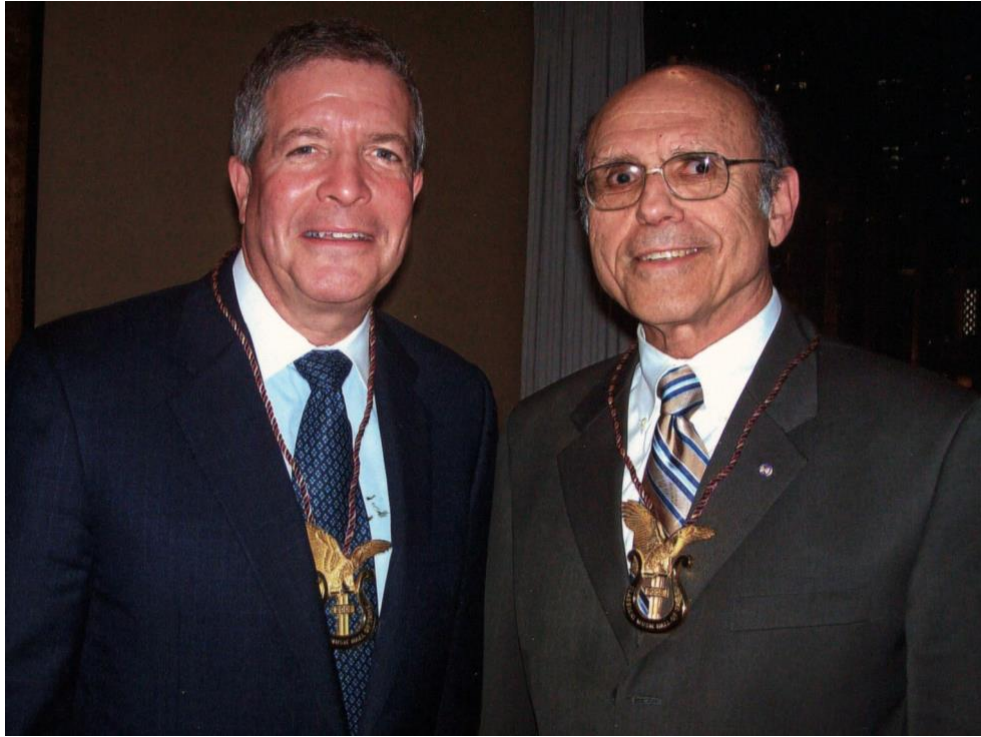
Photograph of Joseph Polisi and Samuel Adler, at induction to the American Classical Music Hall of Fame (2008).