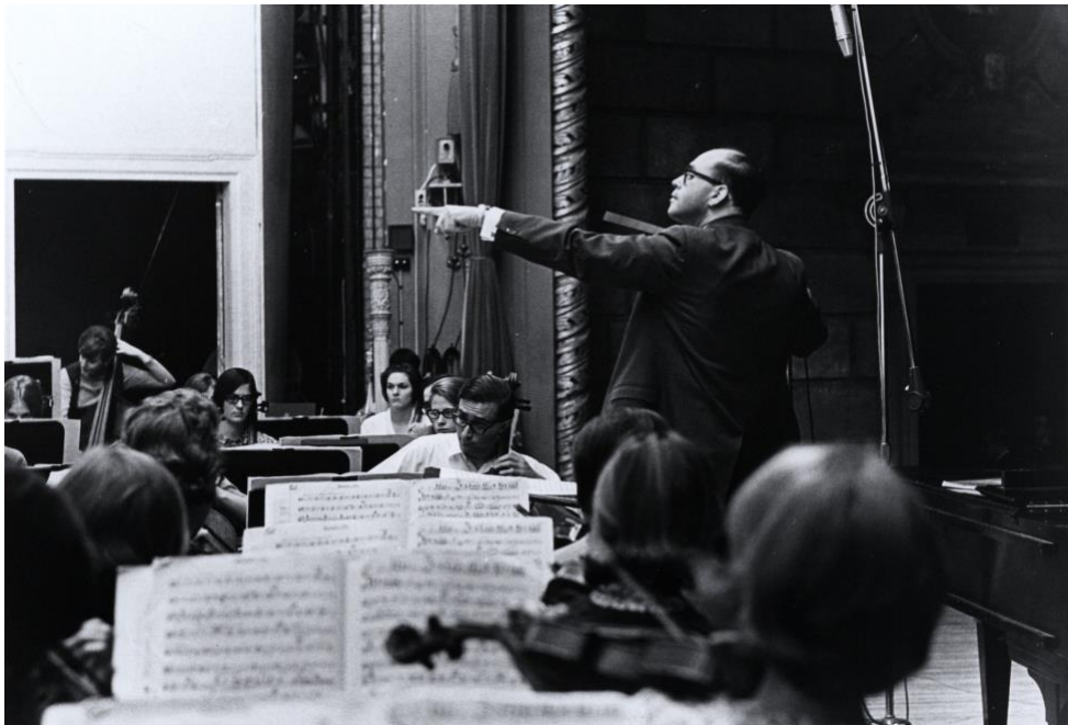
Photograph of Samuel Adler conducting an Eastman Ensemble. Photograph attributed to Louis Ouzer, from ESPA 30-7 (8x10).