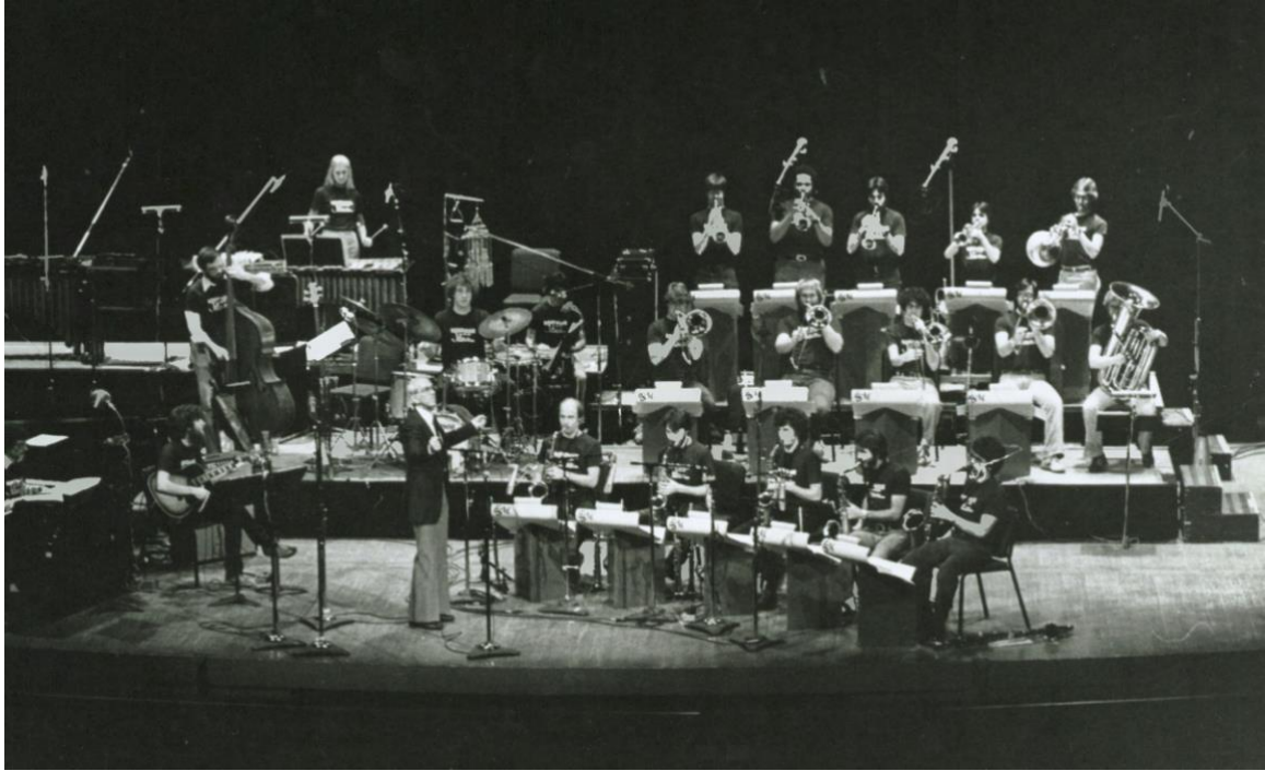
Rayburn Wright conducting the Eastman Jazz Ensemble (November 20, 1981).