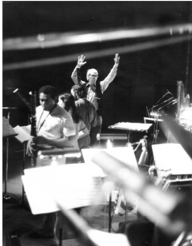
Rayburn Wright conducting the Eastman Studio Orchestra (1974).