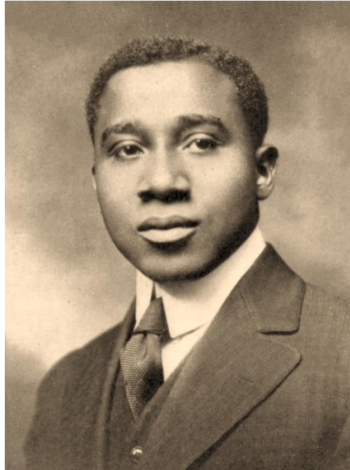
Photograph from publicity circular

R. (Robert) Nathaniel Dett was born in Drummondville (now Niagara Falls), Ontario, Canada, on October 11, 1882. He studied piano as a child, and began more serious musical studies at the Oliver Willis Halstead Conservatory in Lockport, New York. He graduated from the Oberlin Conservatory in 1908, the first African American to receive a BMus. degree there. He pursued additional studies at Columbia, Harvard, the University of Pennsylvania, the American Conservatory, and with Nadia Boulanger in France (1929). He graduated with a MMus degree from the Eastman School of Music in 1932. Throughout his career he was active as teacher, composer, and pianist. He published his first work in 1900; as a composer he often found his inspiration in African-American folk music. From 1913 until 1931 he served as the Director of Music at the Hampton Institute, where he developed the choir which received critical acclaim in the USA and Europe. In 1919 he helped found the National Association of Negro Musicians. He last served as Music Director for the United Service Organizations in Battle Creek, Michigan, where he died on October 2, 1943.