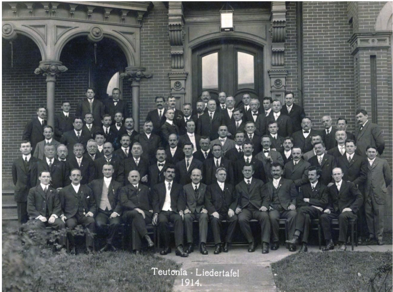
Teutonia Liedertafel Men's Chorus (1914).