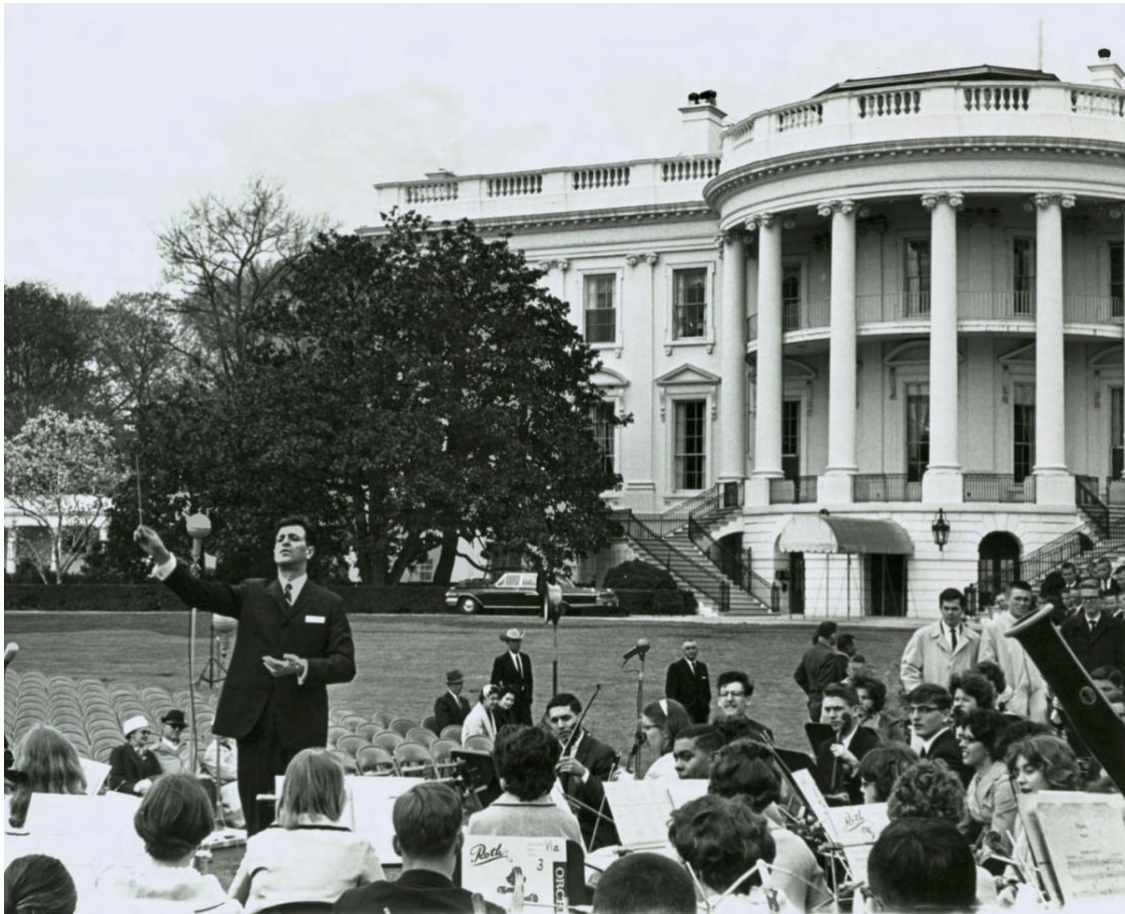
Marvin Rabin conducting the Greater Boston Youth Symphony Orchestra in rehearsal for a performance at the White House (April 16, 1962). From Marvin J Rabin Papers, Box 17, Sleeve 27.