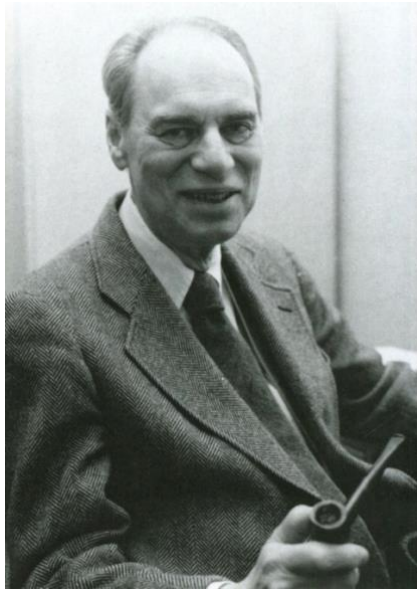
From The Score, 1983.