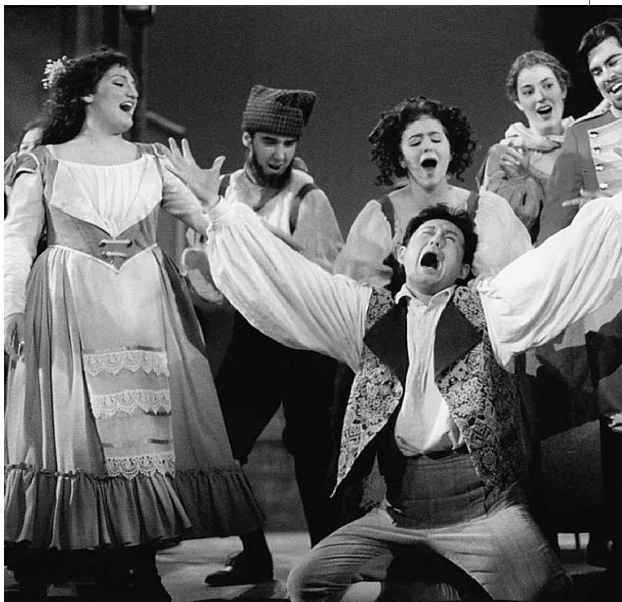
A scene from the Spring 1999 production of L'Elisir d'Amore .

Also in February, the opera department will present Han-