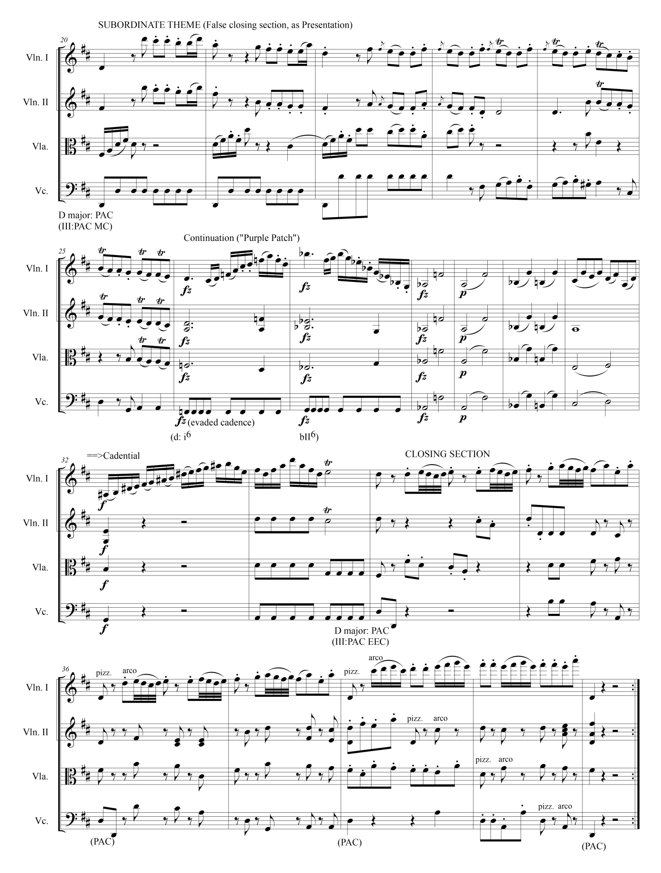
Example 2. Op. 64, no. 2, I, measures 20–40 (Subordinate Theme and Closing Section).