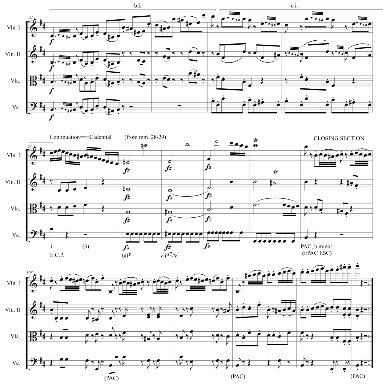
SUBORDINATE THEME 2, compound basic idea (from transition, mm. 9-11)