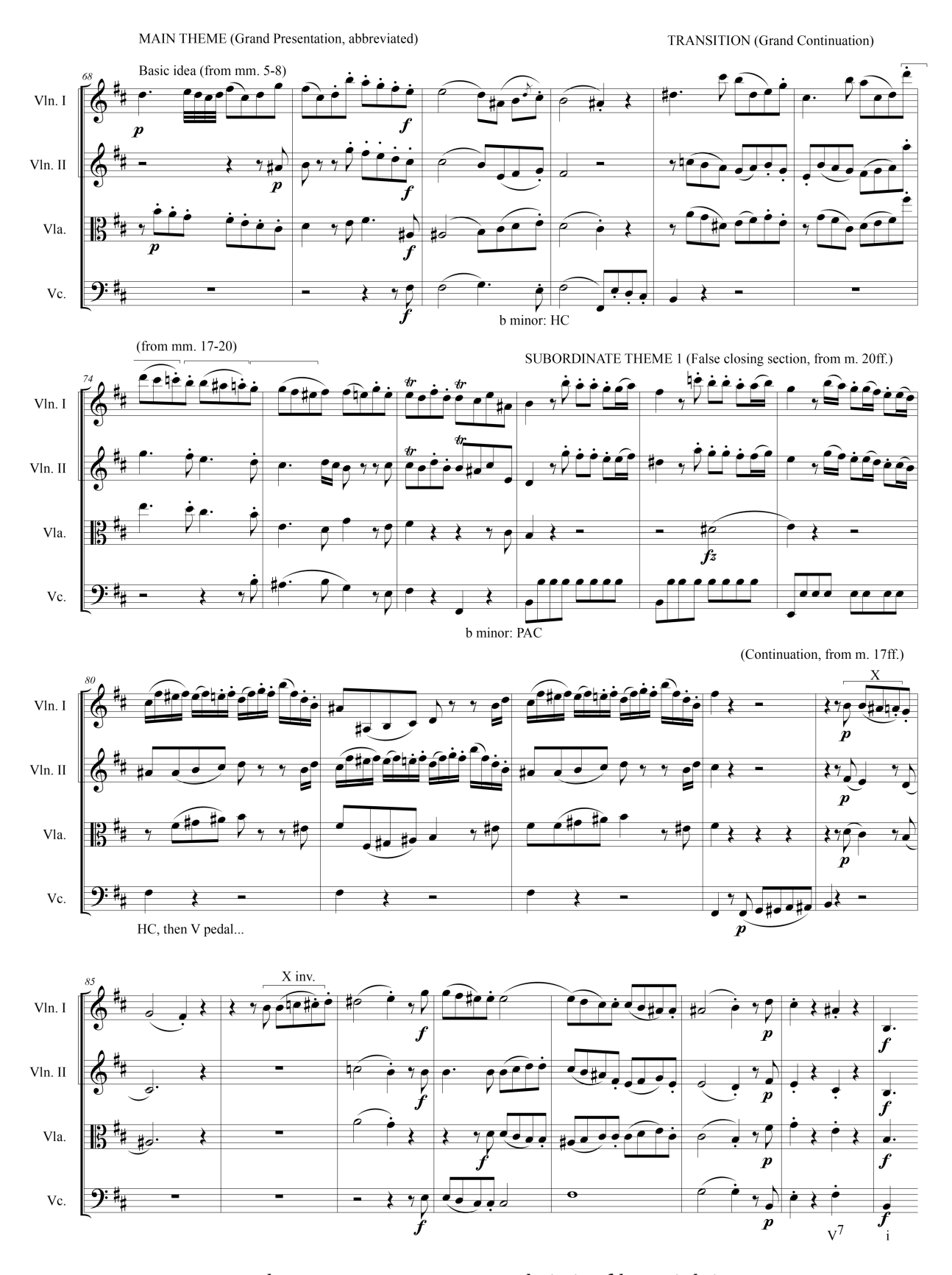
Example 4. Op. 64, no. 2, I, measures 68–92: beginning of the recapitulation.