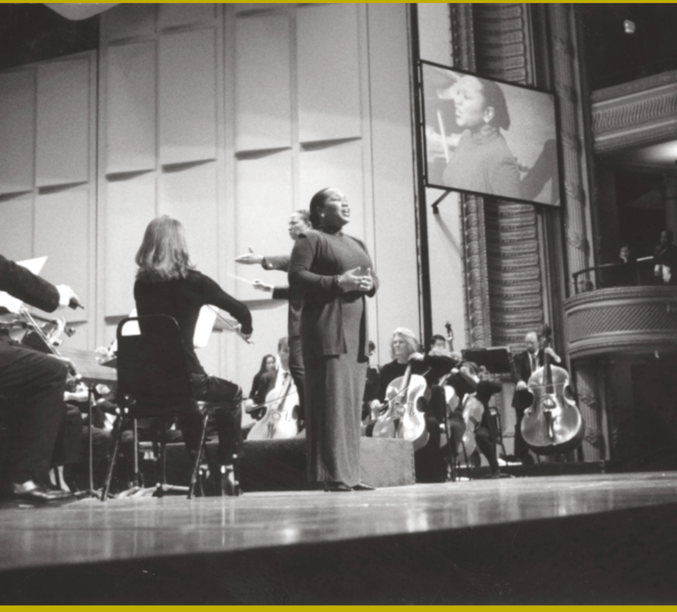
In 1998, the Louisiana Philharmonic Orchestra's Connections series was enhanced by onstage video.