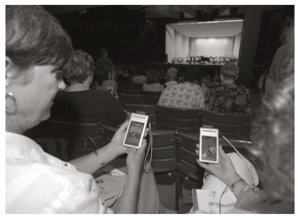
The Concert Companion PDA was developed as part of the Magic of Music by the Kansas City Symphony.

Long Beach Symphony ($30,000 for planning in 2000 and $275,000 in 2002 for three years) – Long Beach's Musical Bridges project was an effort to attract new Latino audiences through education and innovative community partnerships. Highlights included concerts at the Museum of Latin American Art, a world premiere of Cinco de Mayo , composed by the orchestra's music director, and a joint commission of Dos Visiones , inspired by the permanent collection of the Museum of Latin American Art (the museum launched a related exhibit in the months prior to the premiere). The project also involved the joint software development initiative (ORBIT) with Detroit and Kansas City, described earlier.