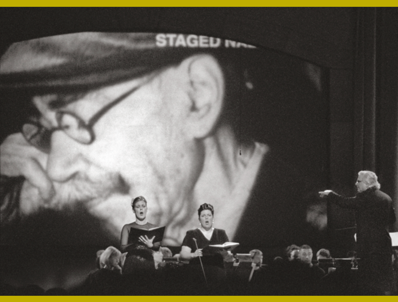
The Oregon Symphony and the Portland Opera Chorus performed Defiant Requiem; the presentation was recorded and broadcast on PBS in August 2003.