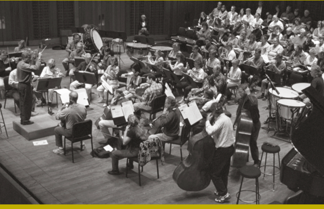
Hugh Wolff rehearsed the Saint Paul Chamber Orchestra in 1998 as students in the adult education series, Musical U, followed the score on stage.