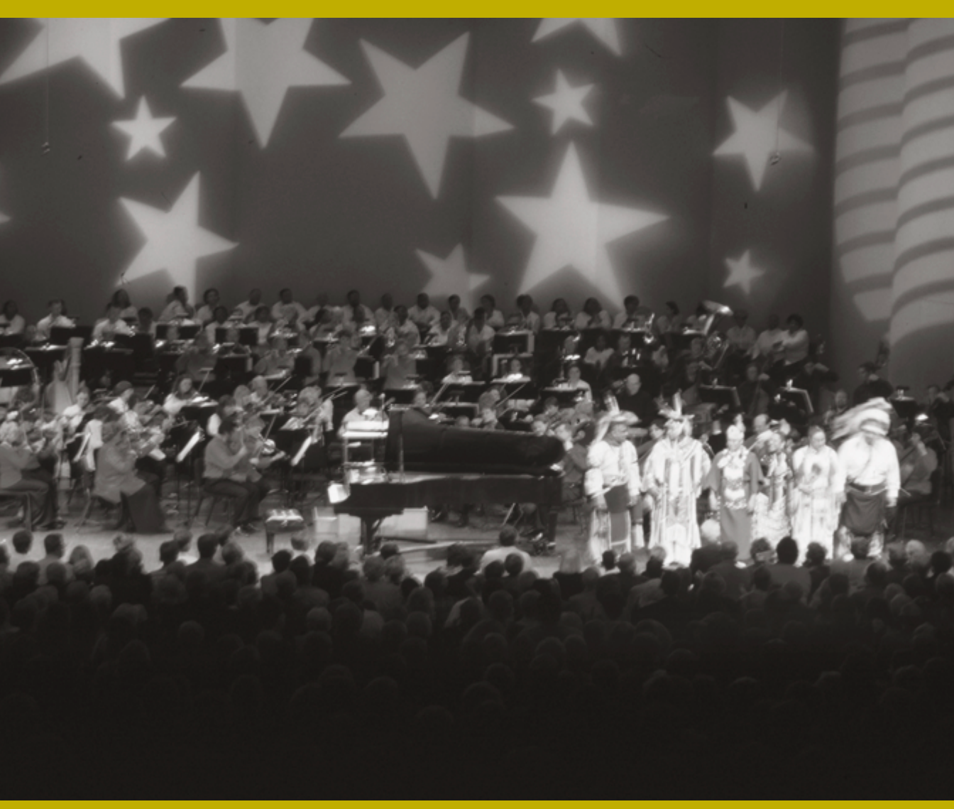
The Wichita Symphony performed as part of its Sound Waves series in November 2003.