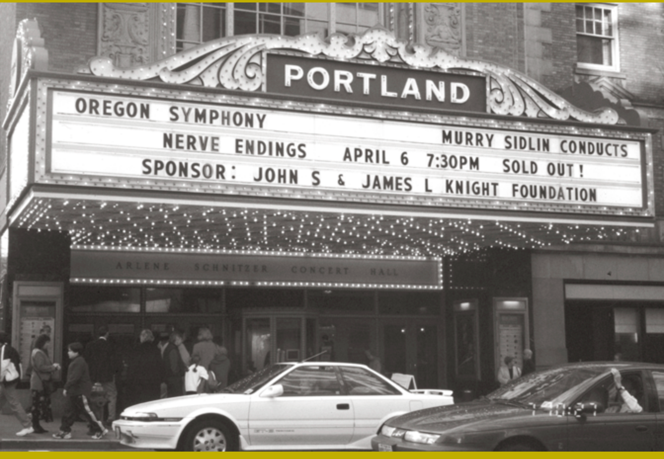
In April 1999, a marquee in Portland told the story of the Oregon Symphony's performance as part of its Nerve Endings series.